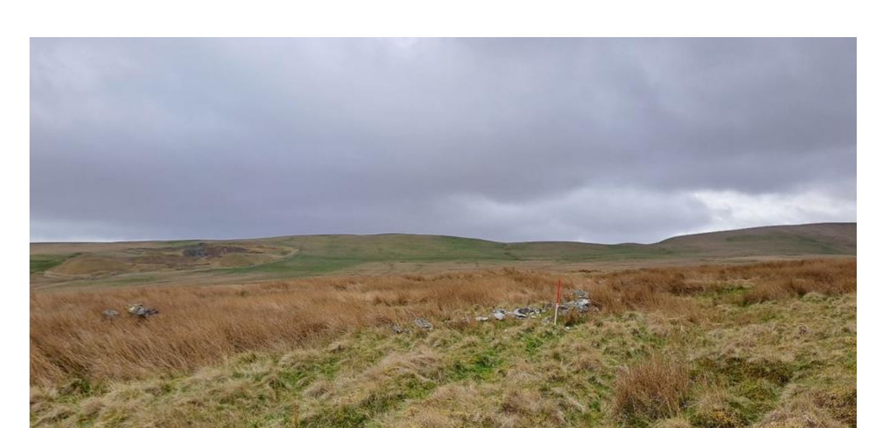
Photograph 1: Photograph of northern extent of SLR101, facing south. The majority of the feature was obscured due to high vegetation.