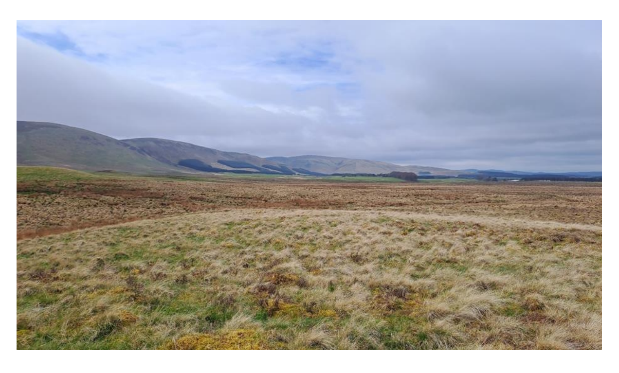
Photograph 4: Photograph from centre of SLR103, looking to southwest, showing the elevation of the feature compared to the surrounding landscape.