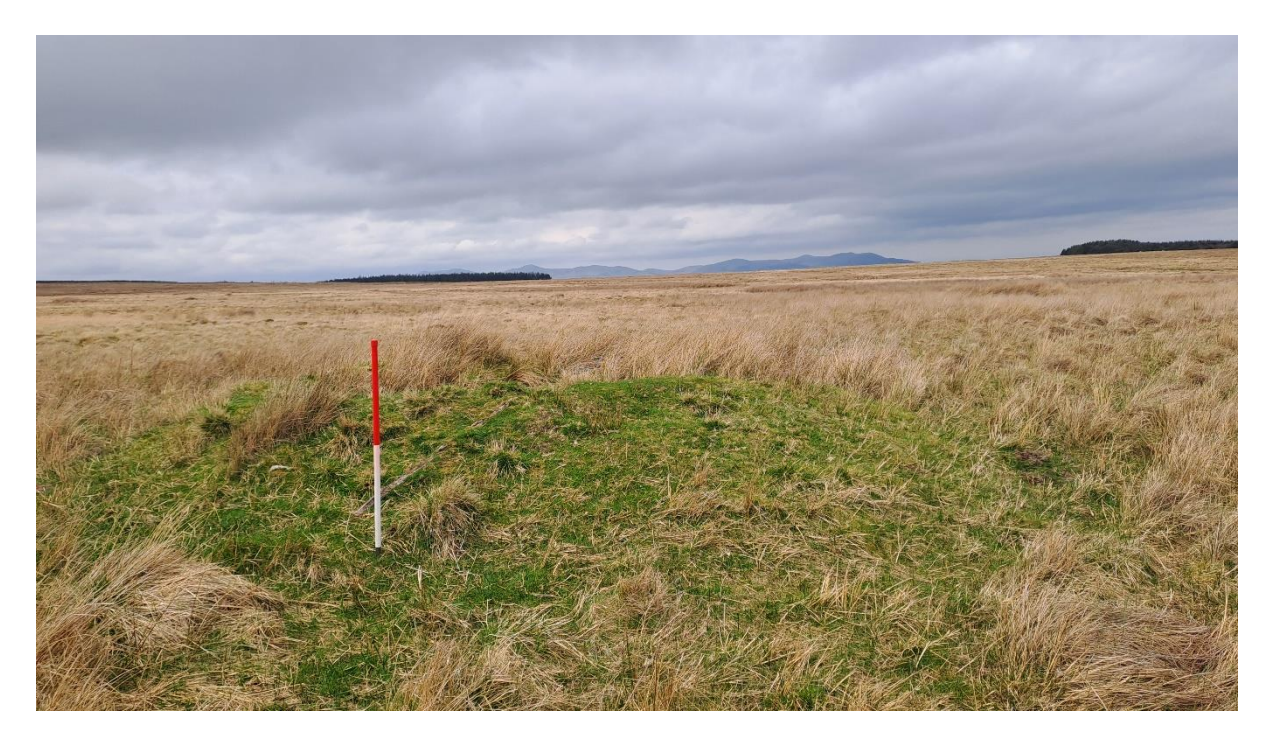
Photograph 2: Photograph of SLR102, looking northwest. The asset presents as a circular turf covered feature with a hollowed out interior.