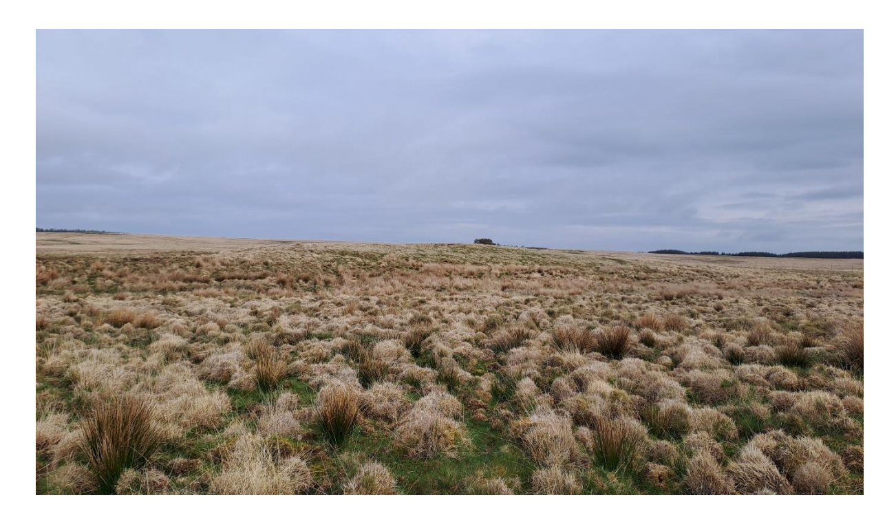
Photograph 3: Photograph of SLR103, taken from the southwest looking northeast. The feature presents as a circular mound, approximately 80m in diameter.