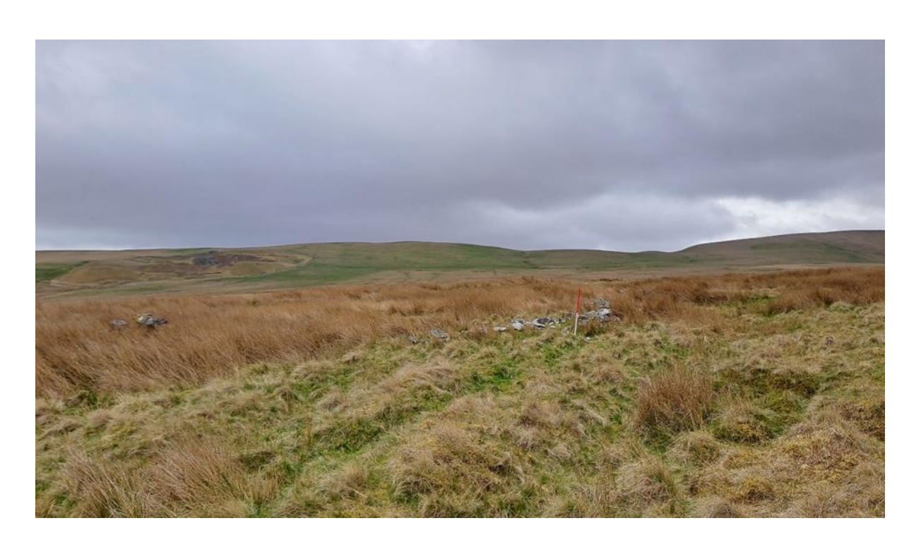
Photograph 1: Photograph of northern extent of SLR101, facing south. The majority of the feature was obscured due to high vegetation.