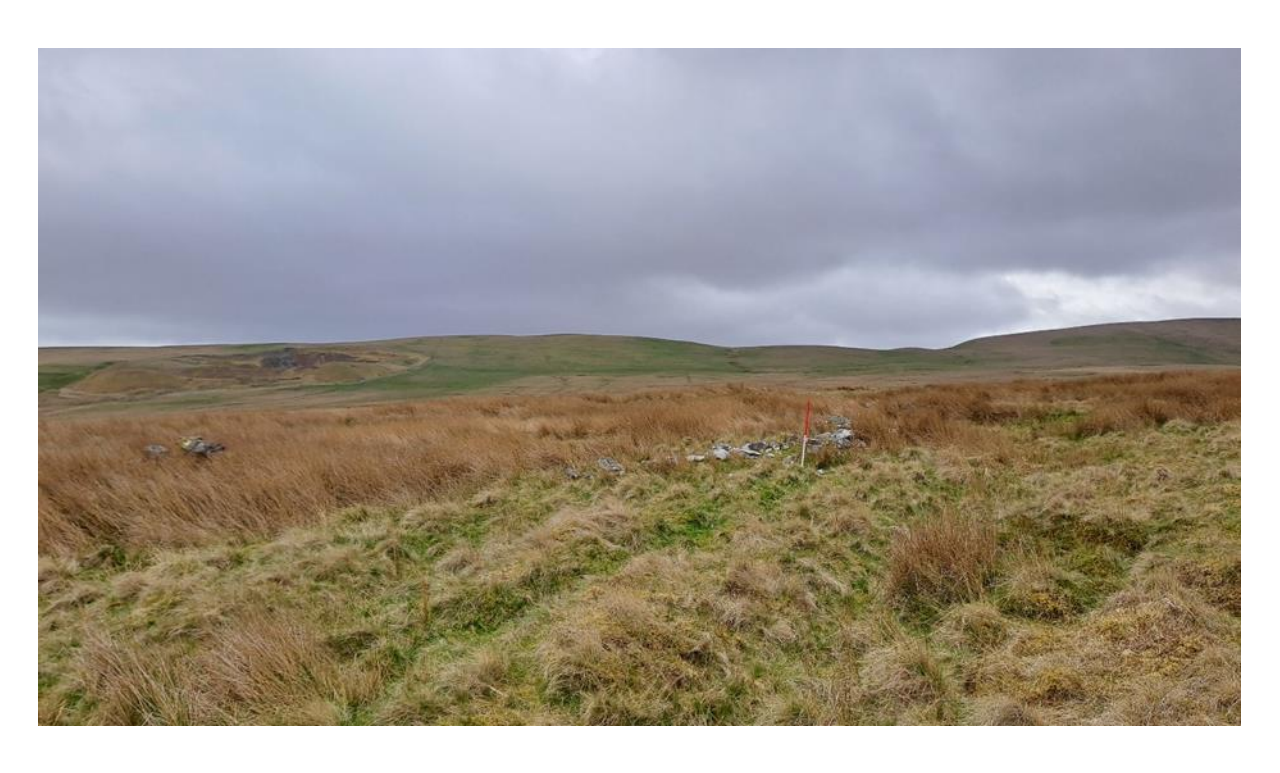
Photograph 1: Photograph of northern extent of SLR101, facing south. The majority of the feature was obscured due to high vegetation.