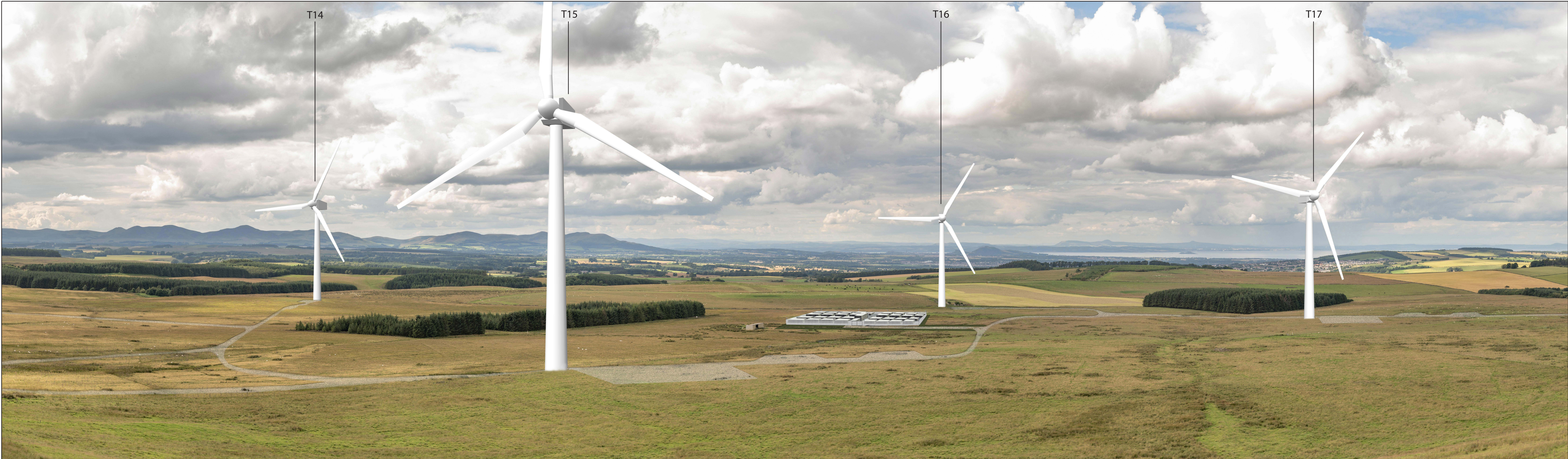
Photomontage showing BESS at construction stage.

AI Viewpoint 1: B7007 layby Drawing number P22-2236_EN_500 TORFICHEN WIND FARM