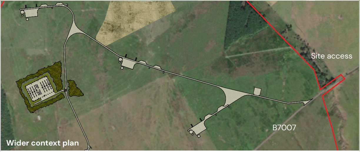
Wider context plan

Block of native woodland planting to filter views of BESS from the B7007 to the east.