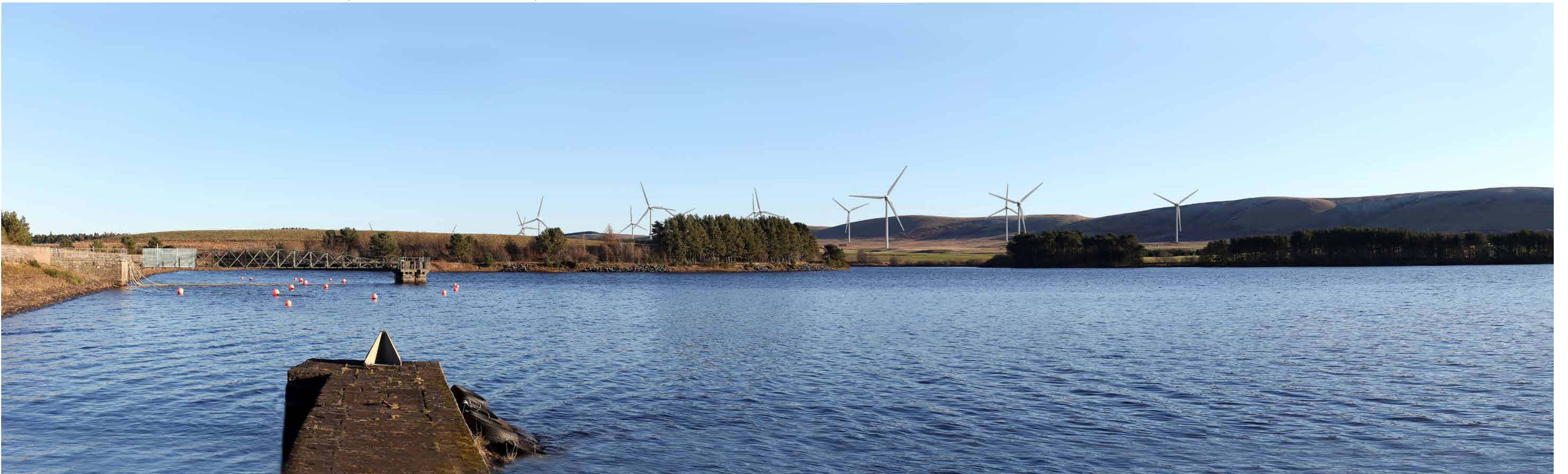
PHOTOMONTAGE OF PROPOSAL (UPDATED DESIGN)