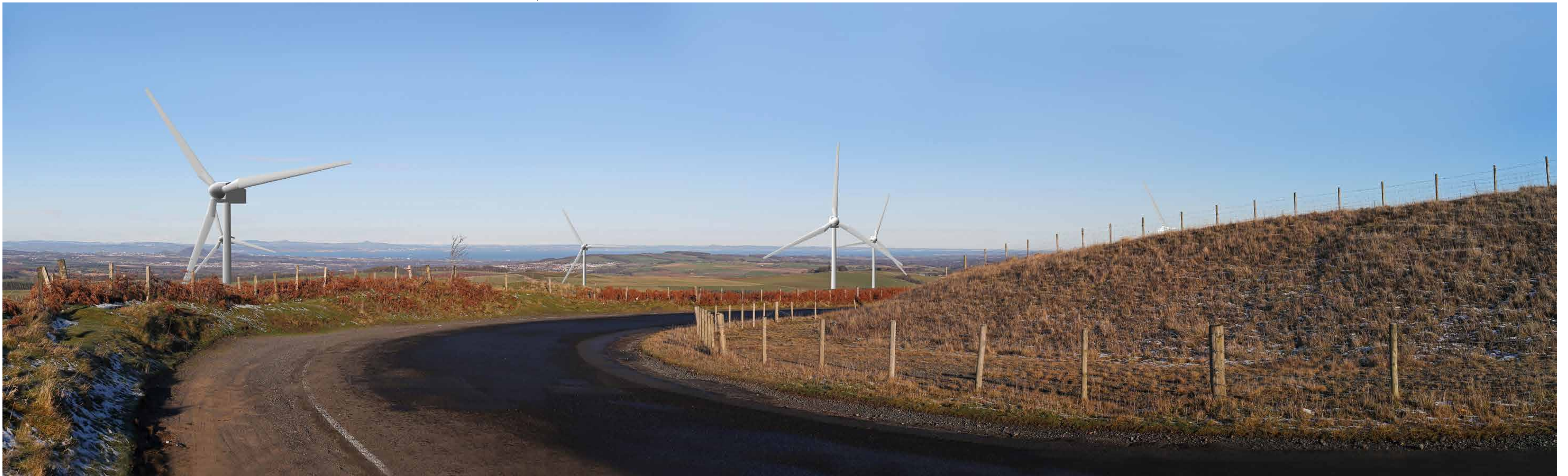
PHOTOMONTAGE OF PROPOSAL (UPDATED DESIGN)