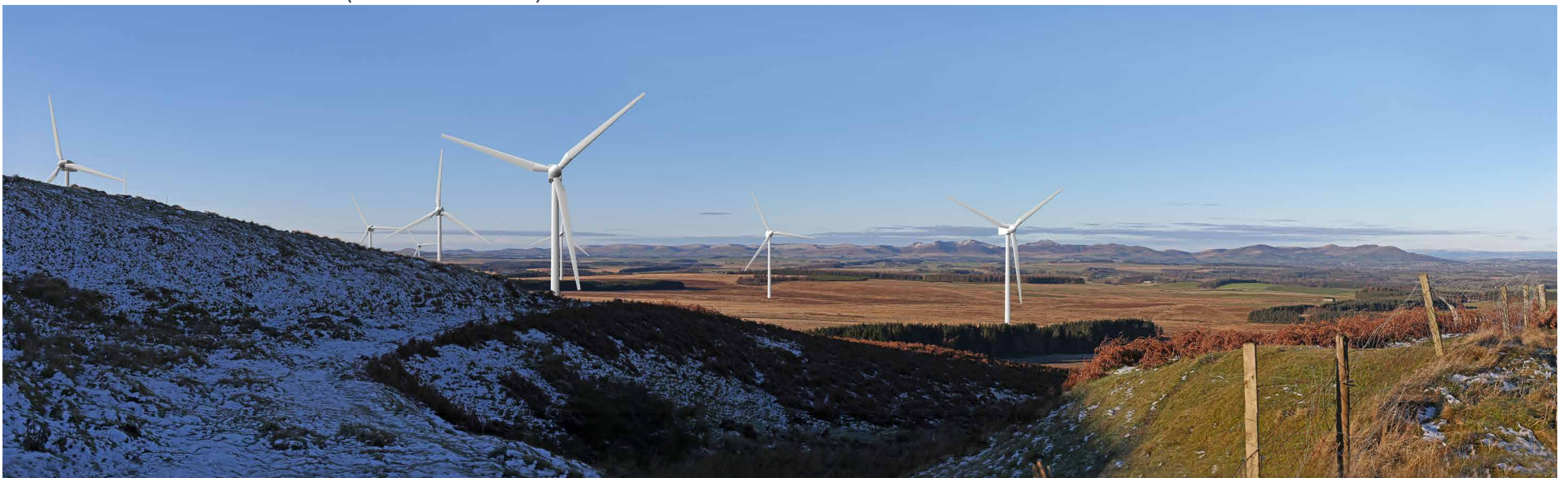
PHOTOMONTAGE OF PROPOSAL (UPDATED DESIGN)